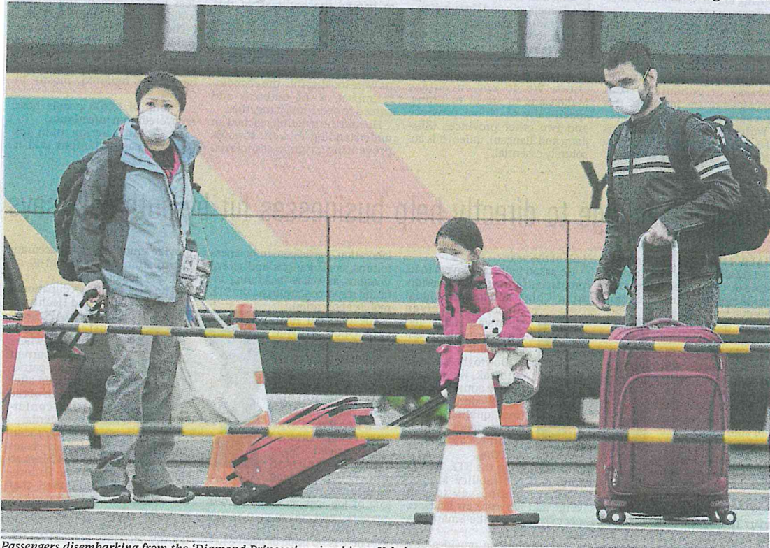
Passengers disembarking from the 'Diamond Princess' cruise ship at Yokohama Port, south of Tokyo, yesterday.