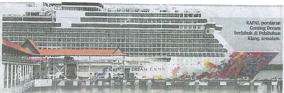
KAPAL persiaran Genting Dream berlabuh di Pelabuhan Klang, semalam.